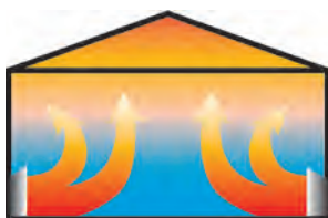
With conventional heating, hot air rises to the top

The heat can be felt shortly after switching on the systems. Because infrared heaters are instantly ready for operation, there is no need for long heat-up times. This minimises the energy consumption and costs. This is a huge advantage in terms of energy efficiency, especially when just using the heat for the courts that are being used.