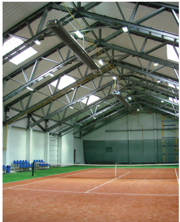
Tennis court heating /ASEN/2./1314 [Subject to technical changes]

As a German manufacturer, we aspire to a high standard of excellence in delivering products and services of the highest quality. Each of our products guarantees economical operations coupled with a low carbon footprint. With Schwank, you opt for a premier manufacturer.