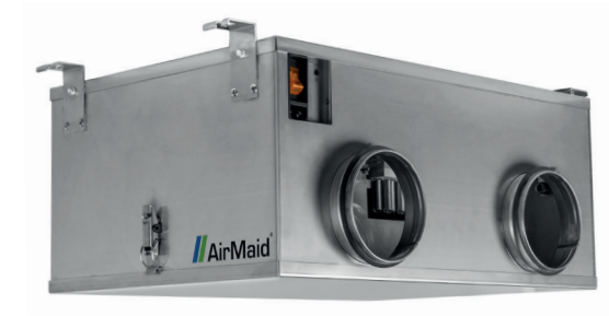
AirMaid® 20000 V