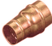
Reducing Straight Coupler